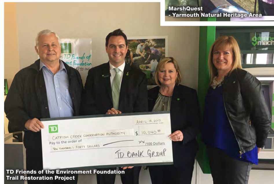
TD Friends of the Environment Foundation Trail Restoration Project