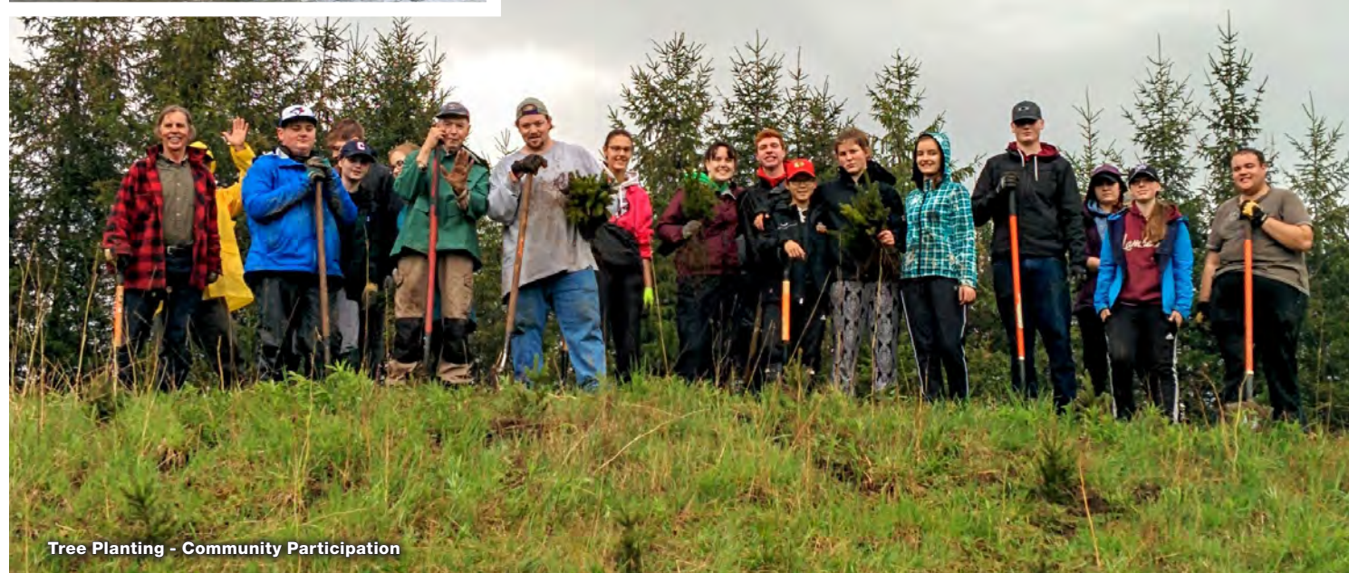
Tree Planting - Community Participation