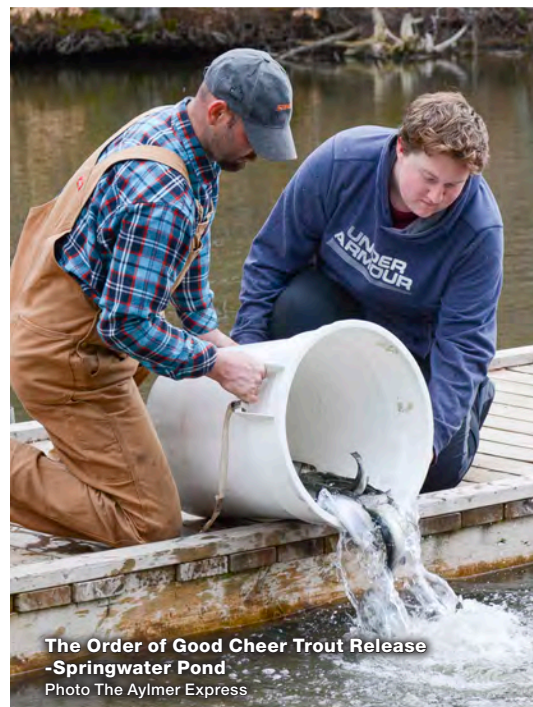
The Order of Good Cheer Trout Release -Springwater Pond