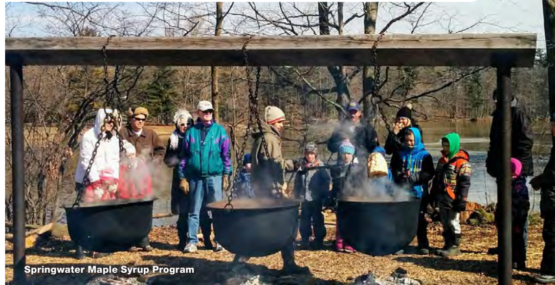
Springwater Maple Syrup Program