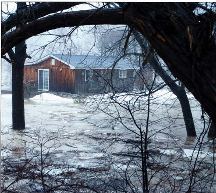
February Flood – Port Bruce