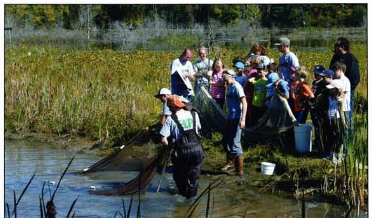
Marsh Quest – Yarmouth Natural Heritage Area