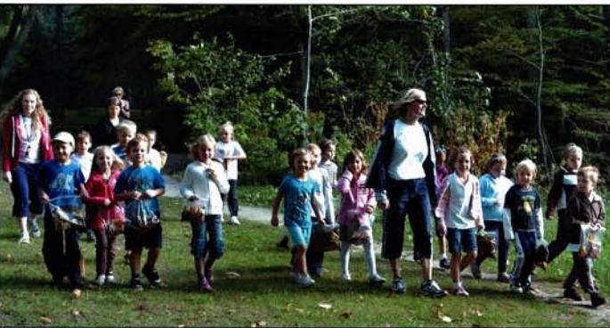
Environmental Education Outings – Springwater Forest