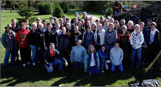
Environmental Leadership Program – TD Great Canadian Shoreline Cleanup - Catfish Creek