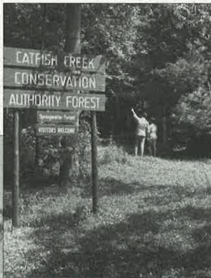
Centre: '60's - Springwater Forest.