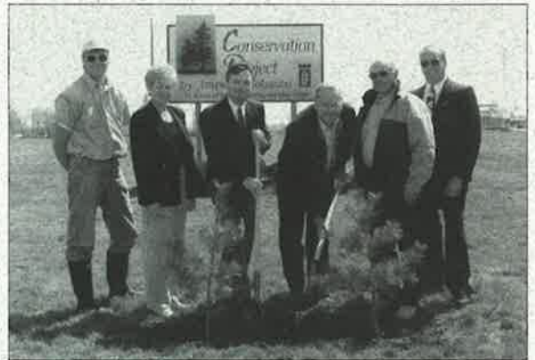
Tree Planting Site - Imperial Tobacco Canada Limited.