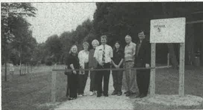
Official Opening - Carolinian Canada Millennium & Arboretum Trail Springwater Conservation Area.