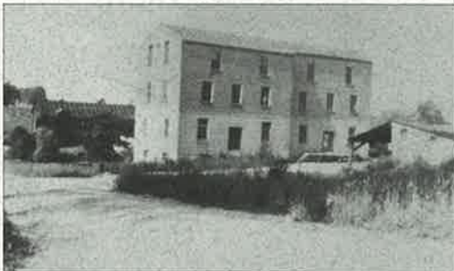
Top Left: '50's - White's Mill, Springwater.

Naturally, we also remain dependent on the support which comes to us from the five municipalities within the watershed who have realized that water management and conservation are absolute necessities for sustainable development and a healthy community. We continue to thank them for their support, and for their input into our Board of Directors. We at CCCA look forward to the next 50 years and its many challenges.