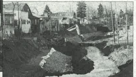
Top Right: '80's - Aylmer Slope Stability Project.