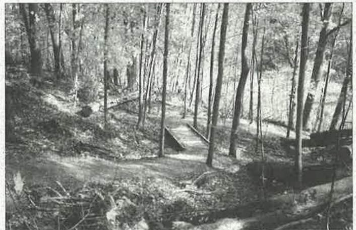
North Shore Trail – Springwater Forest