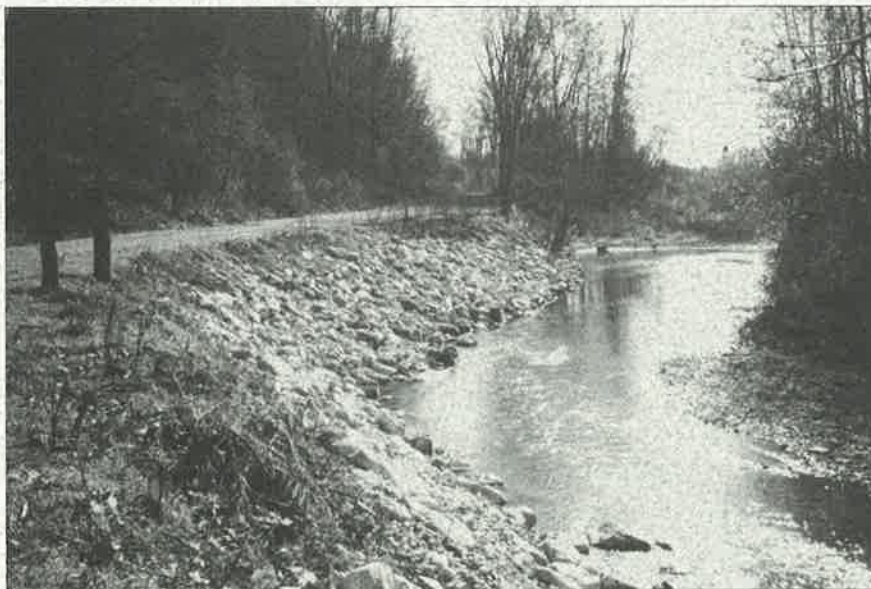
Fisheries Enhancement - Yarmouth Natural Heritage Area

tragedy in Walkerton. The CCCA is currently involved in the delivery of three new provincially driven water initiatives announced in 2001. The Municipal Groundwater Studies, Provincial Groundwater Monitoring Network, and Ontario Low Water Response Programs will help produce the monitoring data which is essential for sound planning and management of our local groundwater and surface water resources.