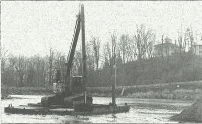
Flood Control Dredging – Port Bruce