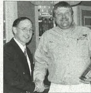
The National Wild Turkey Federation - Elgin Wild Turkey Chapter