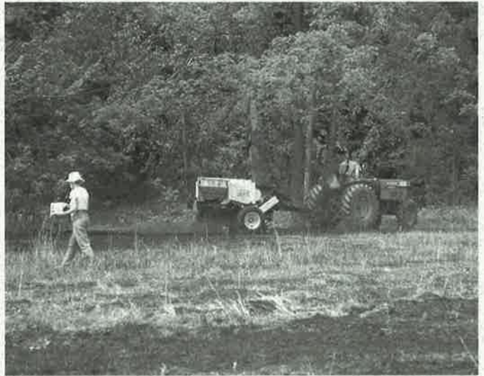
Tallgrass Prairie Restoration-Yarmouth Natural Heritage Area