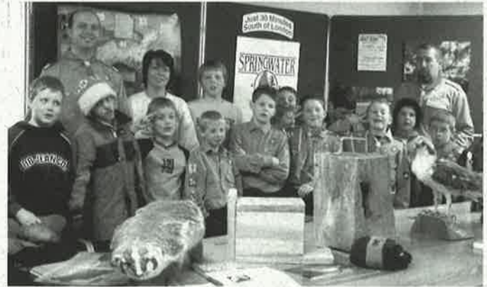
Environmental Education Programs