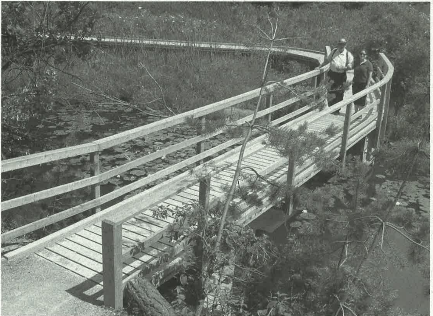
Millpond Trail and Boardwalk - Springwater Conservation Area