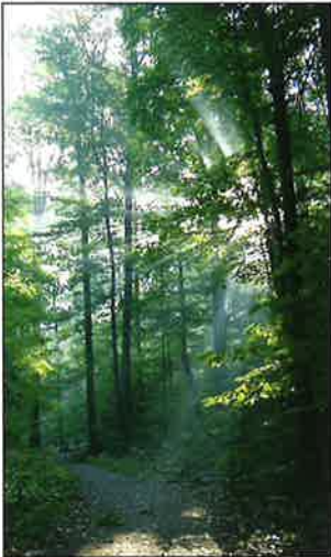
Hiking Trails - Springwater Forest