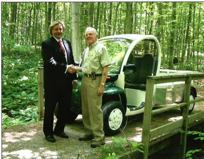
Daimler-Chrysler Global Electric Motorcar Presentation