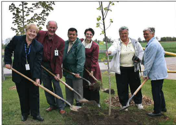
Middlesex-Elgin VON Volunteer Appreciation Tree Planting Ceremony - Springwater Conservation Area