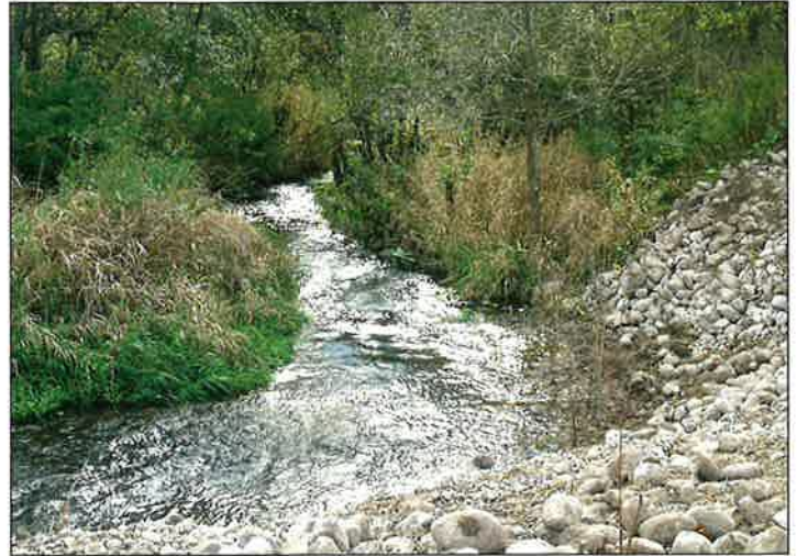
Bradley Creek Rehabilitation Project