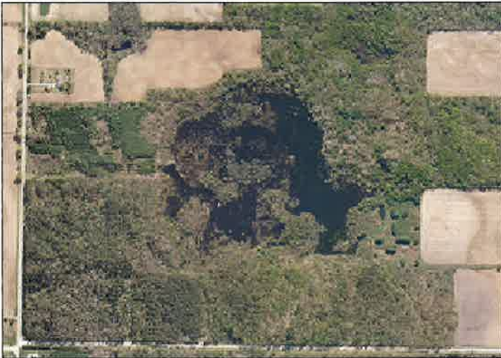
New Watershed Orthophotography - Calton Swamp