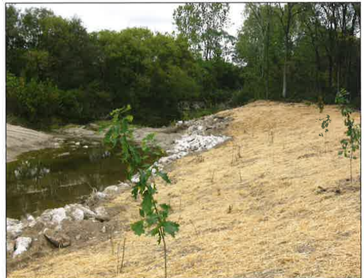
Streambank Stabilization "Greencover Canada Program"