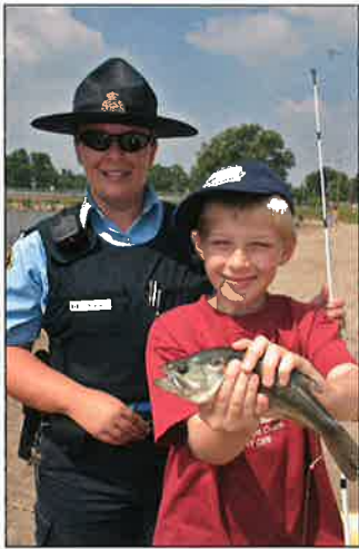
Kids, Cops, & Canadian Tire Fishing Days - Springwater Conservation Area