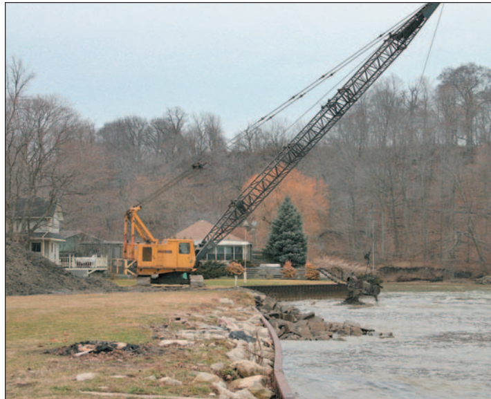
Flood Control Dredging - Port Bruce