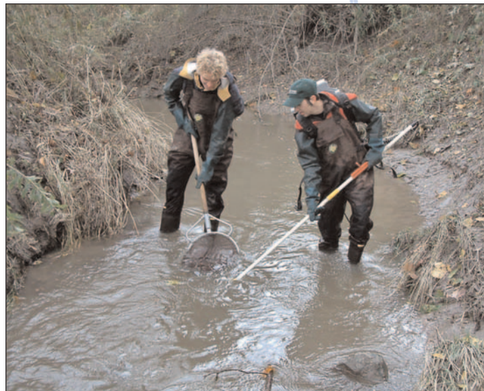
Electroshocking Environmental Leadership Program Students