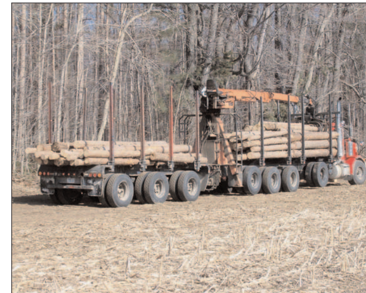
Municipal Woodlot Management Program - Malahide Woodlot Commercial Harvest