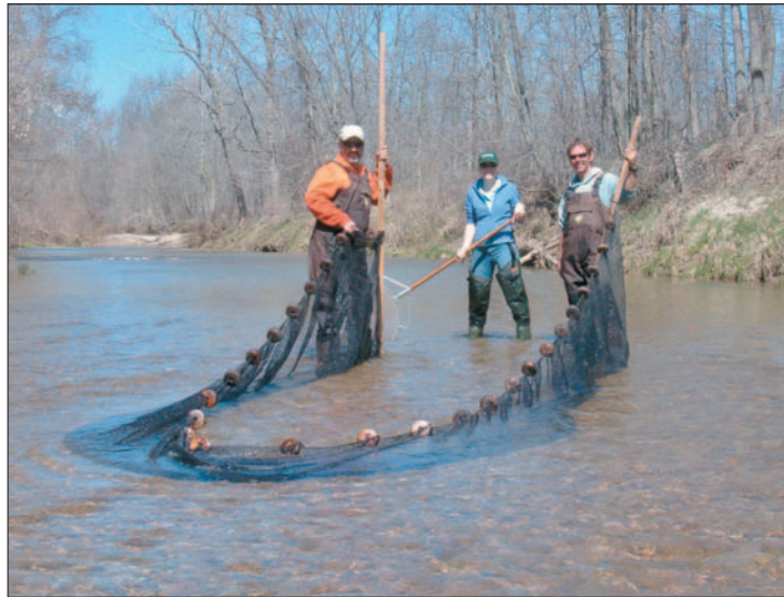
Fish Habitat Assessment- Main Branch Catfish Creek