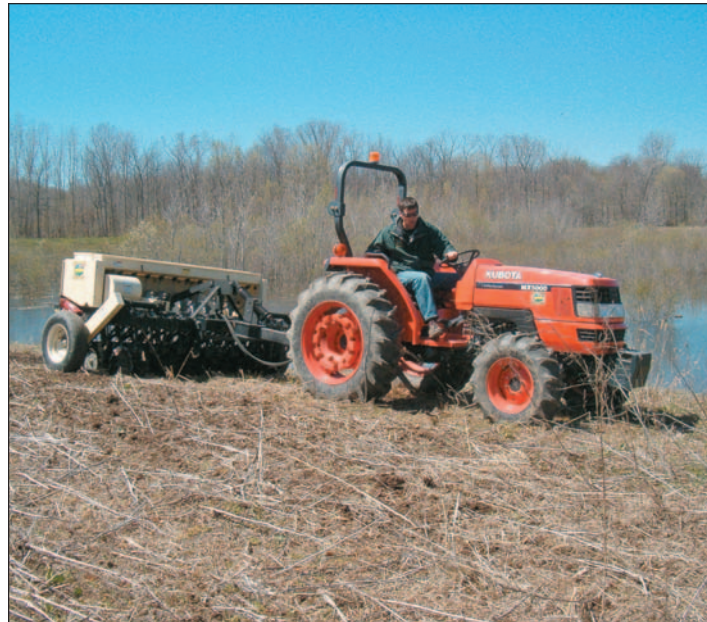
Tallgrass Prairie Restoration Yarmouth Natural Heritage Area