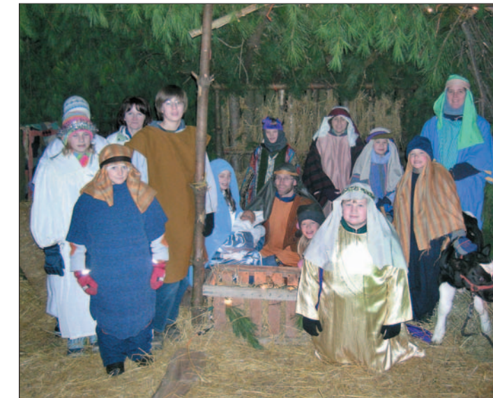
Christmas Spirit Walk- Springwater Conservation Area