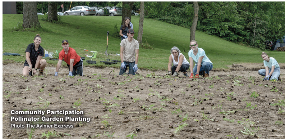
Community Participation Pollinator Garden Planting