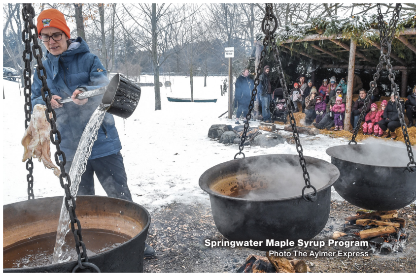
Springwater Maple Syrup Program