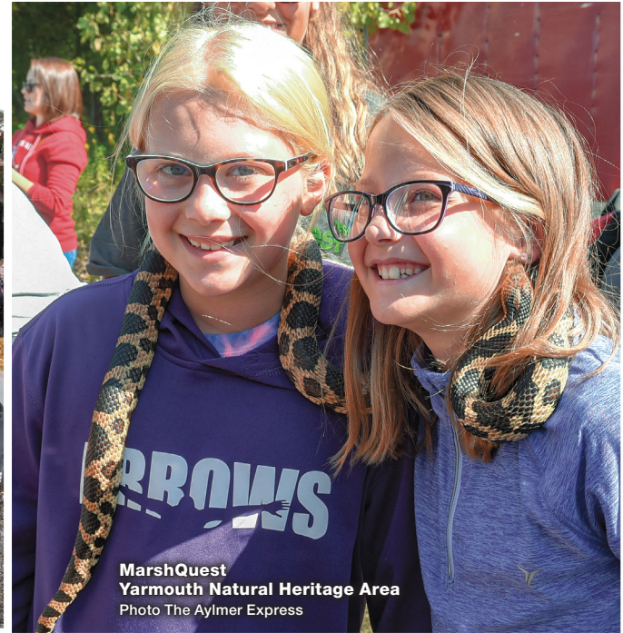
MarshQuest Yarmouth Natural Heritage Area