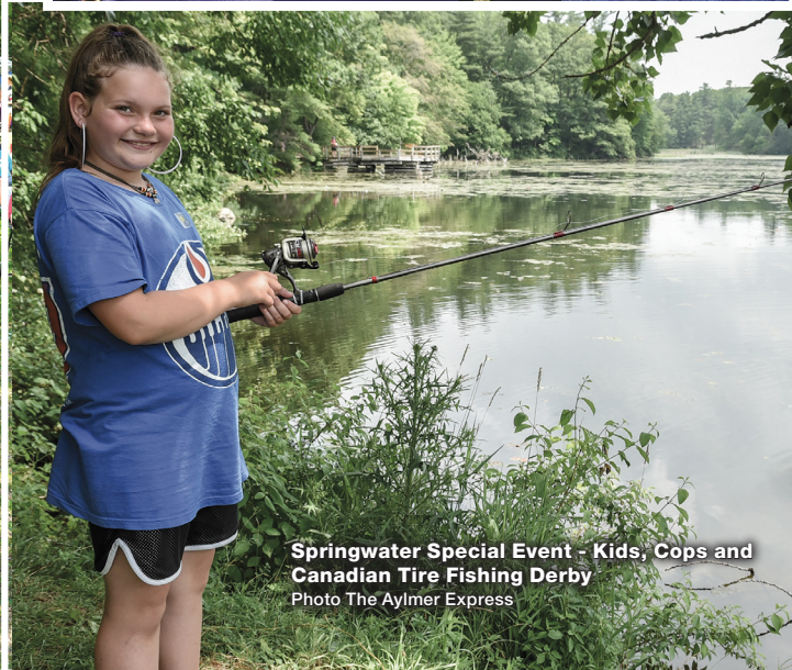
Springwater Special Event - Kids, Cops and Canadian Tire Fishing Derby