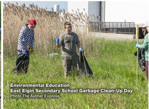
Environmental Education East Elgin Secondary School Garbage Clean-Up Day

“To communicate and deliver resource management services and programs in order to achieve social and ecological harmony for the watershed”