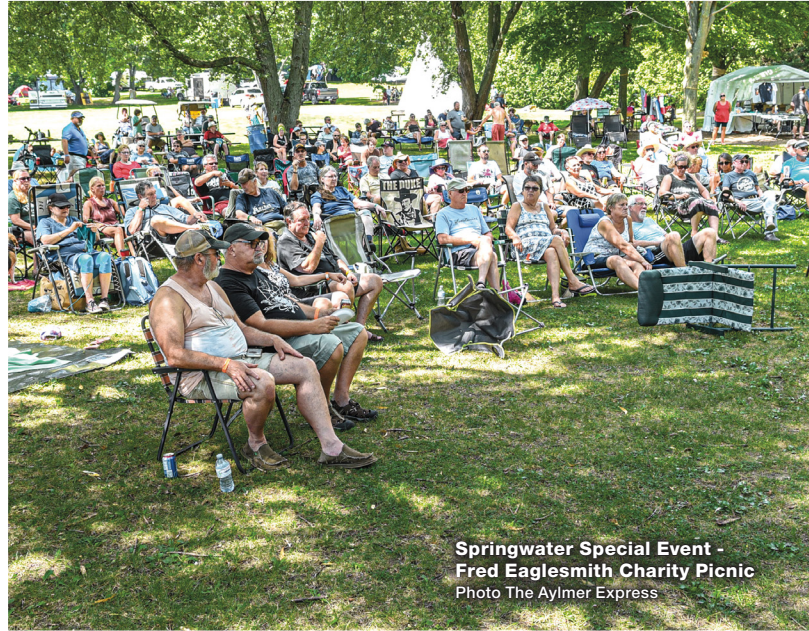
Springwater Special Event - Fred Eaglesmith Charity Picnic